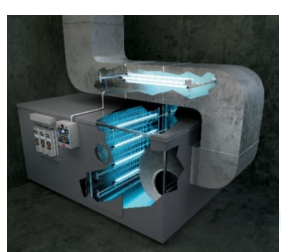
Air Handler & Airstream Disinfection