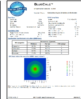
Blue-Calc Report / Analysis

Fresh-Aire UV systems are installed within the HVAC system and are not intended to diagnose, treat, prevent or cure any disease. The systems have not been tested on Coronavirus and is not a medical device.