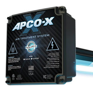
Fresh-Aire UV APCO-X whole-house air purifier

UV disinfection systems for HVAC are an ideal proactive measure to complement filtration. Microorganisms, particularly viruses, are so small that filters are mostly ineffective. The UV systems have also been shown to reduce problematic molds and pathogens that are found within the HVAC system and drain pan that would otherwise be introduced and distributed throughout the envelope of the building.